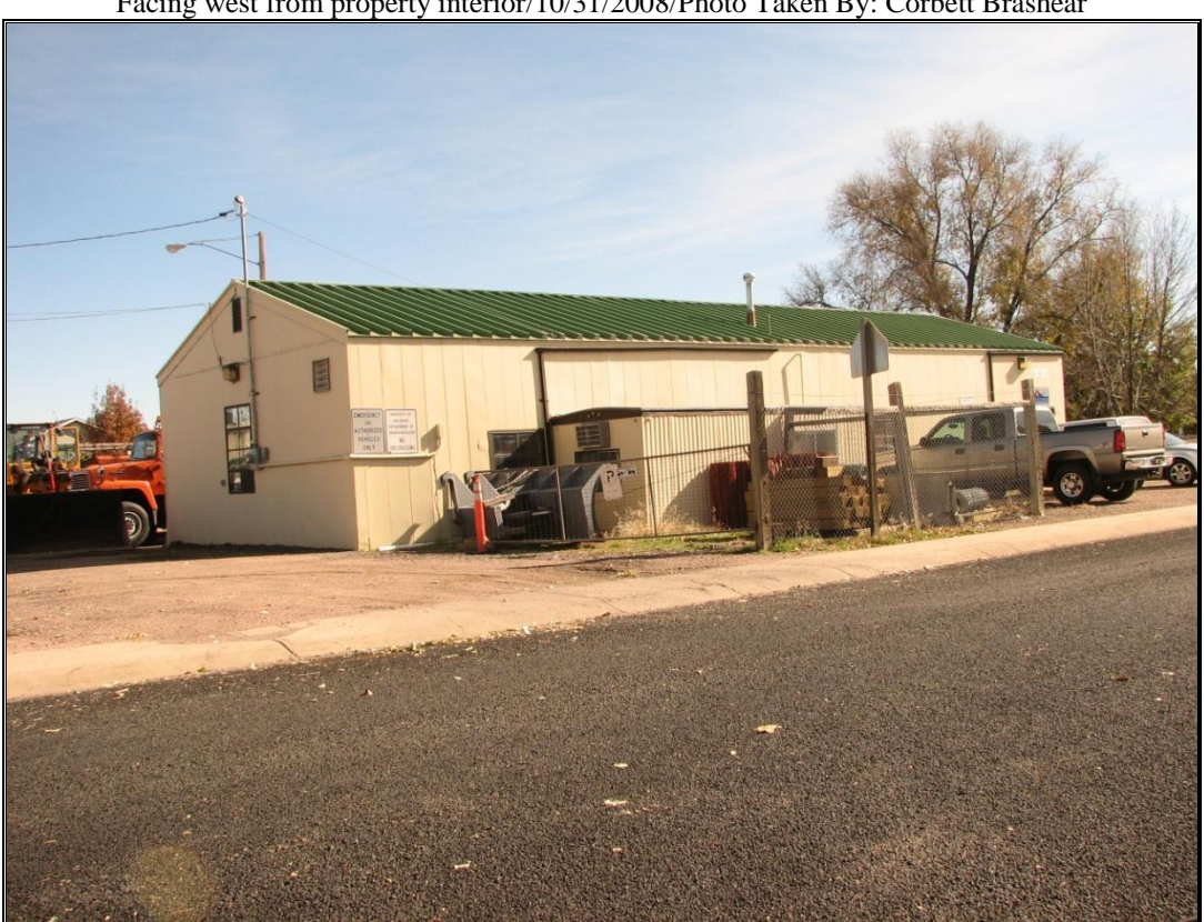
Facing southeast from 4<sup>th</sup> Street/10/31/2008/Photo Taken By: Corbett Brashear

Facing west from property interior/10/31/2008/Photo Taken By: Corbett Brashear