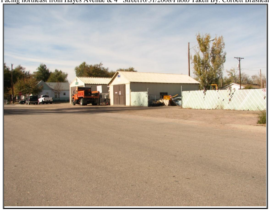
Facing northwest from Hayes Avenue/10/31/2008/Photo Taken By: Corbett Brashear

Facing northeast from Hayes Avenue & 4<sup>th</sup> Street10/31/2008/Photo Taken By: Corbett Brashear