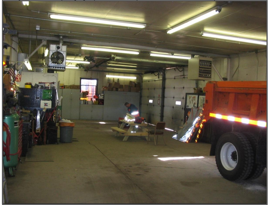
Larger building interior/04/26/2008/Photo Taken By: Corbett Brashear

Facing east down alley on property north boundary/04/26/2008/Photo Taken By: Corbett Brashear