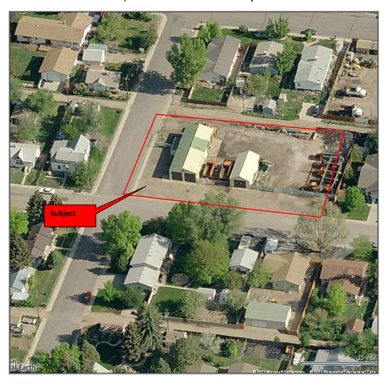
Bird's Eye View Photo from Live Search Maps Web Site